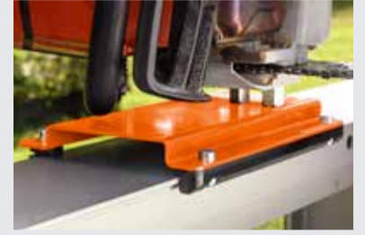
Flexible saw carriage with a perfect glide, prepared for both crank and bar nose steering.