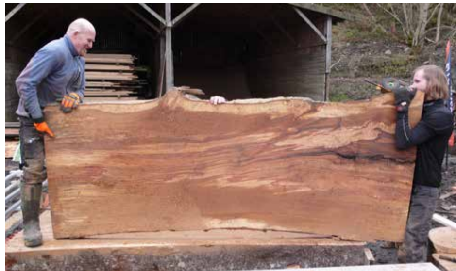
• Beautiful boards in Beech were cut with the Big Mill during Logosol Open House.