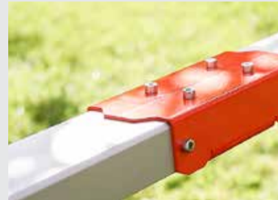
Practical carrying handle. In the middle of the of the struts there is a horizontal grip friendly carrying handle.