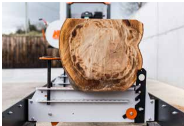
• Reliable rail frame remains straight even under the load of the heaviest logs