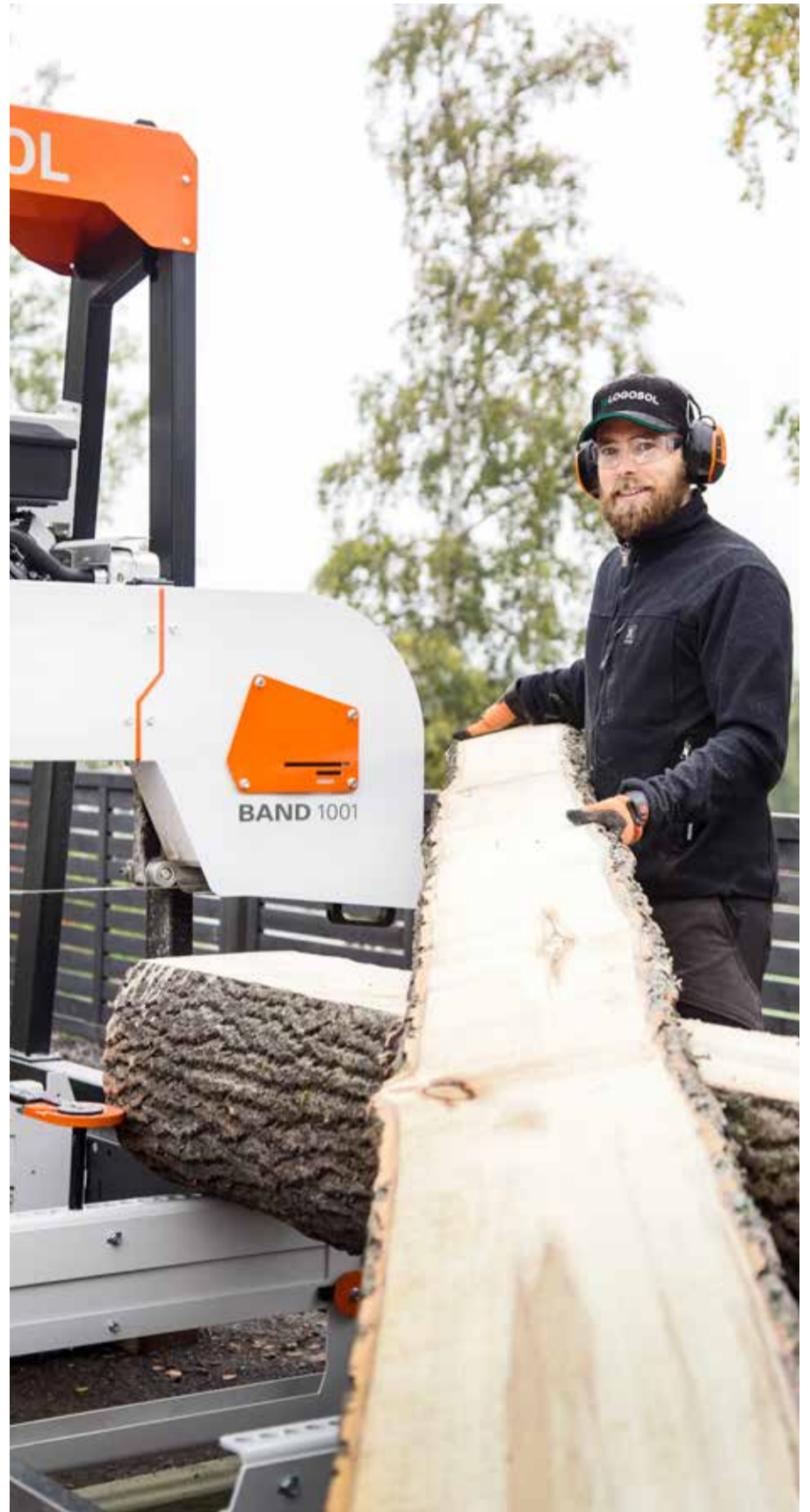
• Logosol bandsaw mills combine well tested technics with innovative solutions.

“ After selling bandsaw mills from other manufacturers for many years we are now taking the next step and launching a new in-house made bandsaw mill with a focus on user friendliness and capacity. The design is as revolutionizing as the chainsaw mills was when they came out 1989.”