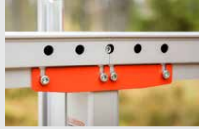
Reinforced locking of the guide rail sections makes the assembly easier and gives increased stability.

The F2 Chainsaw mill is good value and incredibly easy to use. Even if you've never done any sawmilling before you'll quickly get going with the production of planks and boards for your building projects.