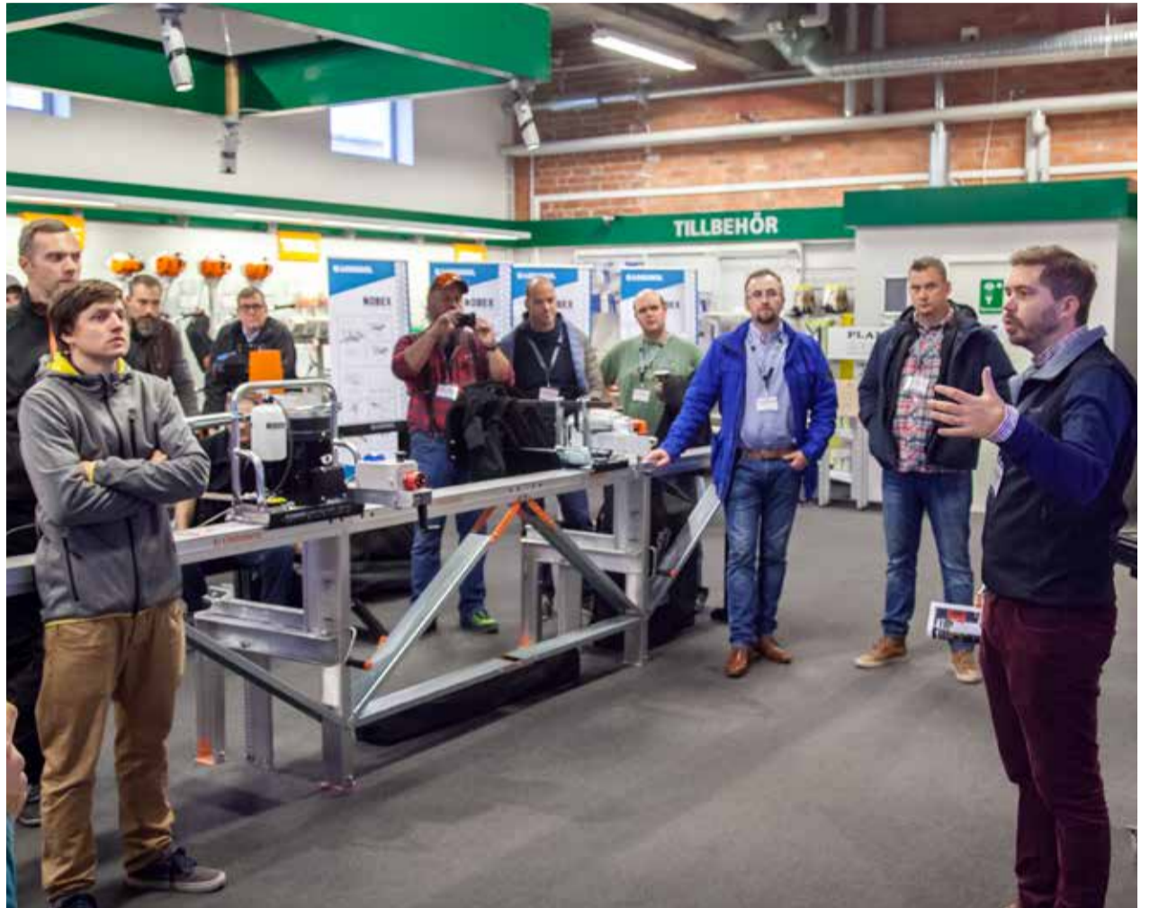
• Logosol is growing with in-house products. Our extensive experience within sawmilling gives us unique strengths and possibilities to create revolutionary products.

– It was an incredible feeling to show our distributors these new products. 21 countries were represented and it really feels like we are on the right track, both when it comes to product design and functionality.