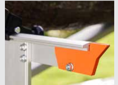
A pointed metal plate grips the log when rolling it on to the log lifters and gives extra support.