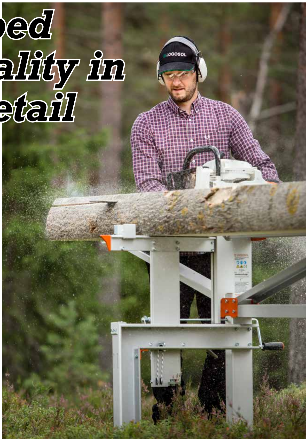
• Logosol launches the F2 chainsaw mill. This new model gathers 30 years of experience in chainsaw milling and it's the perfect sawmill for cutting logs for your own use.

When it comes to powering these sawmills you can either use a larger chainsaw that has double guide bar bolts and that is over 50cc or use the Logosol electric chainsaws that gives you a little bit more capacity. Log house moulders can also be used. Powered either by an electric motor or by a Stihl MS661 chainsaw.