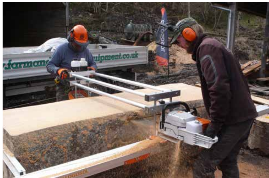
• The new Big Mill System is perfect for handling giant logs.