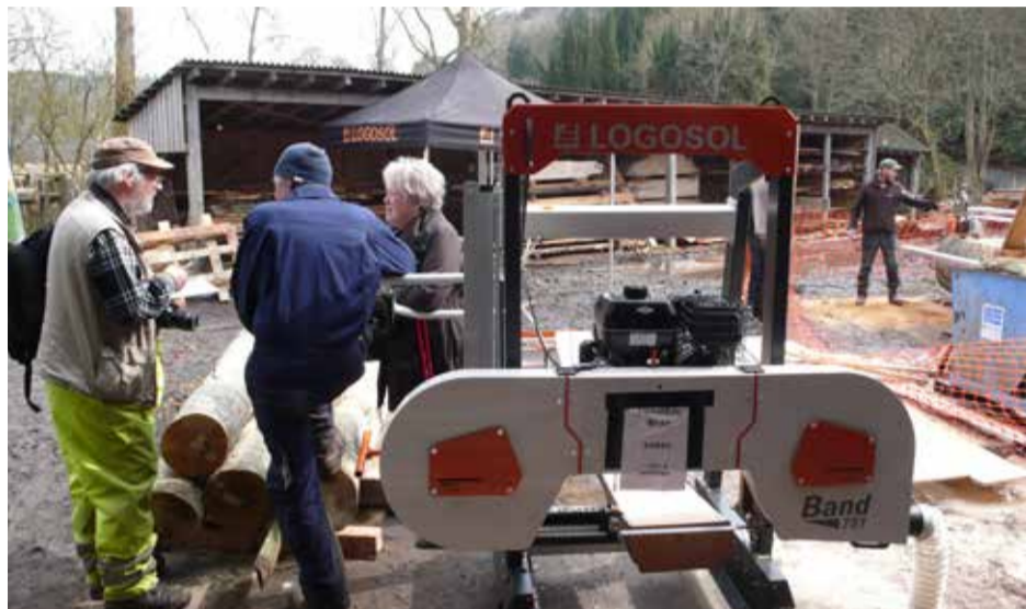
• The Open House gathered visitors with great interest in sawmilling.