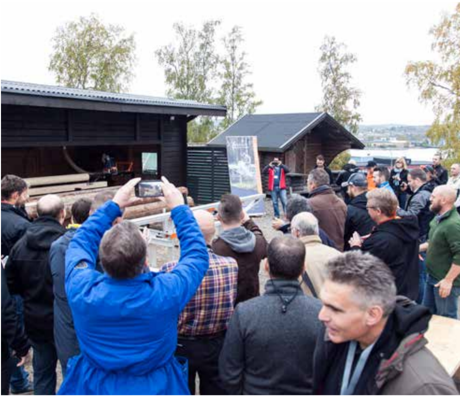
• During the World Meeting both the new F2 Farmer's chainsaw mill and the bandsawmills were presented to the distributors.