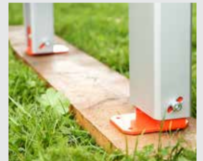
Feet for added stability are included.