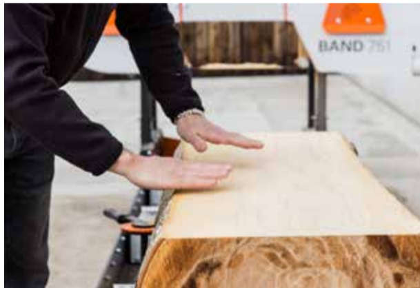
• Beautiful boards in beech.