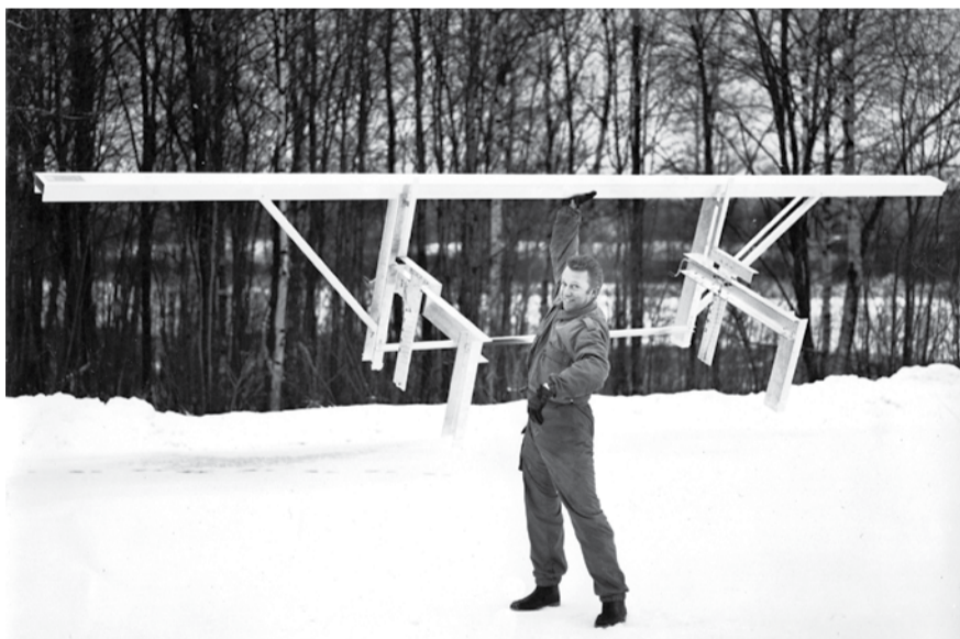
• Since the start Logosol has developed products within small scale wood processing. From the first chainsawmill in 1989, to the first in-house made bandsaw mill in 2017.