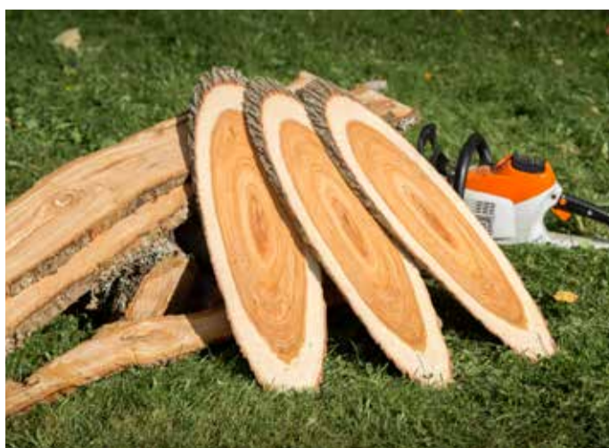
• With your own sawmill it's only your own imagination that sets the limits of what you can do. If you cut diagonally through the log you can produce beautiful pieces that be used for signs or cutting boards for example.

If you like to, you can create fun and unique designs out of your logs. What is your next project? Give us a call and we will be able to supply you with the right equipment for the job and maybe some inspiration as well!