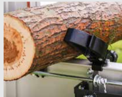
Two XL log holders are included to ensure the highest precision.