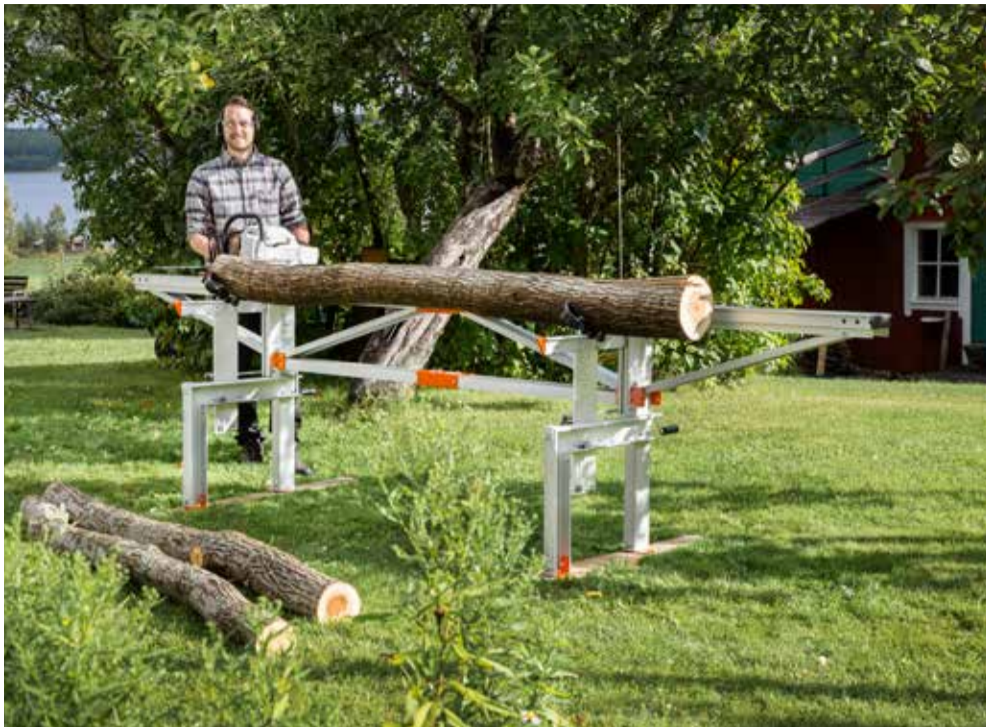
• With the F2 Farmer's chain sawmill you can cut all sorts of wood, from hard oak to knotty pine.