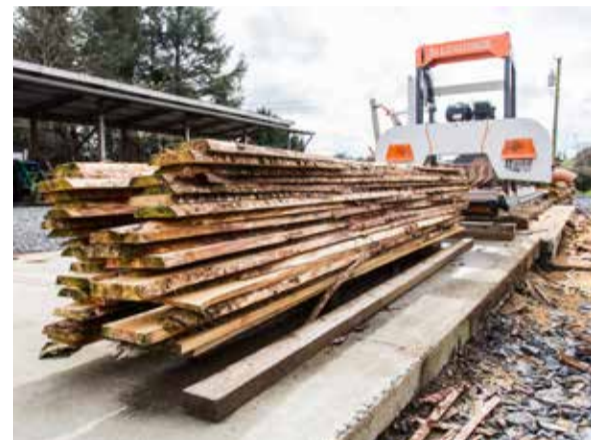
• With a bandsaw mill everything goes faster and you get less waste, says Kristo Dawson.

At the moment Kristo Dawson is very busy building a special type of oven where he can produce charcoal ecologically out of local oak.