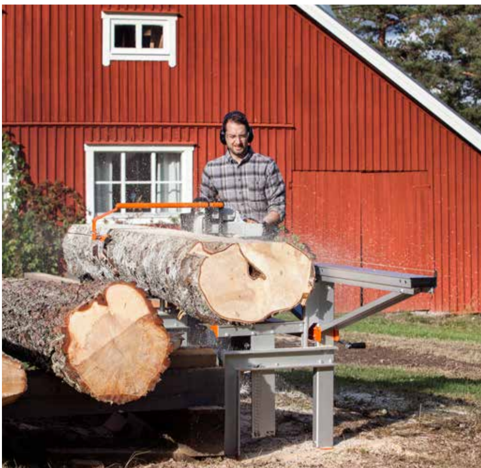
• The Logosol F2 can easily handle logs that are up to 60 cm in diameter. Winches are used to lift the logs up so you can work upright most of the time.